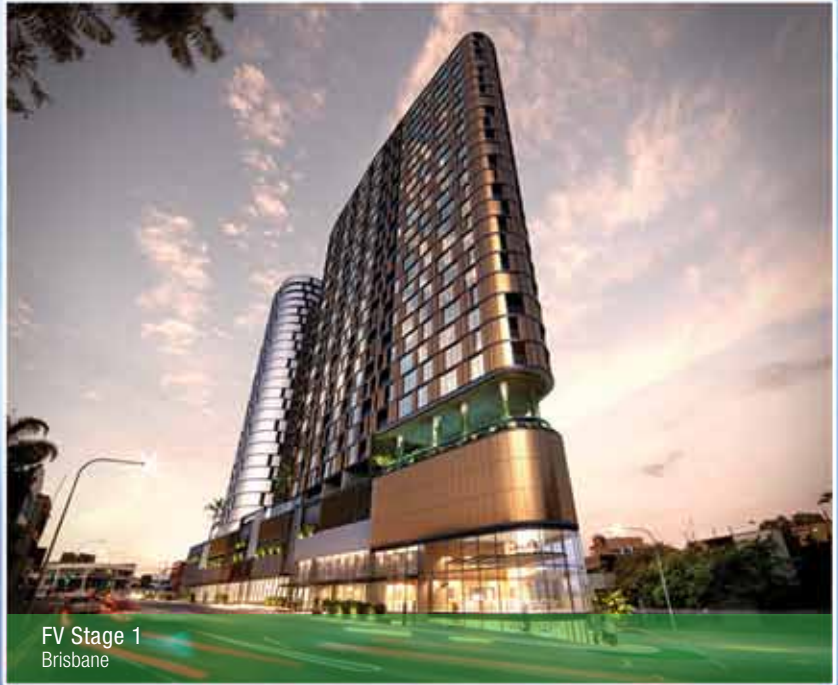
FV Stage 1 Brisbane

Thakral Capital Australia Pty Ltd Sydney and Melbourne, Australia