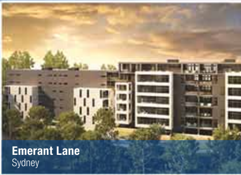
Emerant Lane Sydney