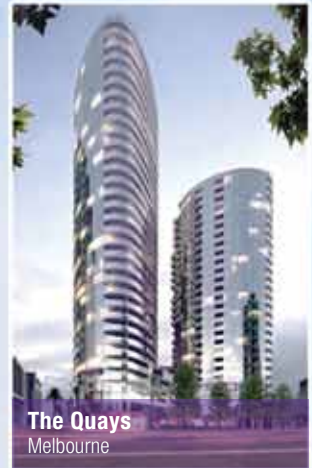
The Quays Melbourne