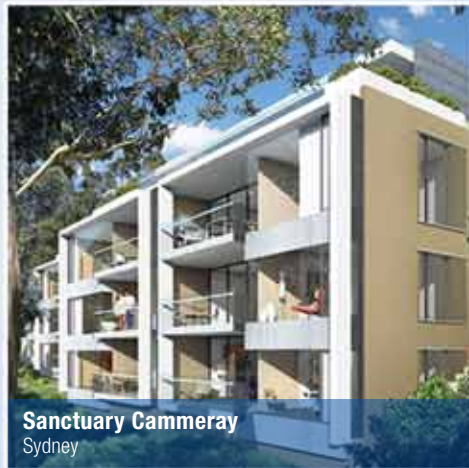
Sanctuary Cammeray Sydney