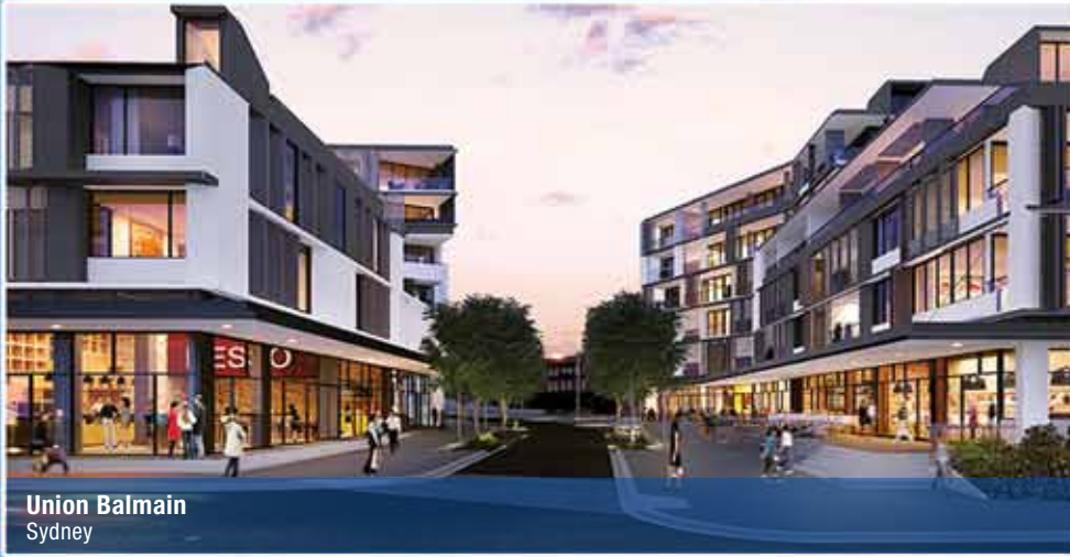
Union Balmain Sydney