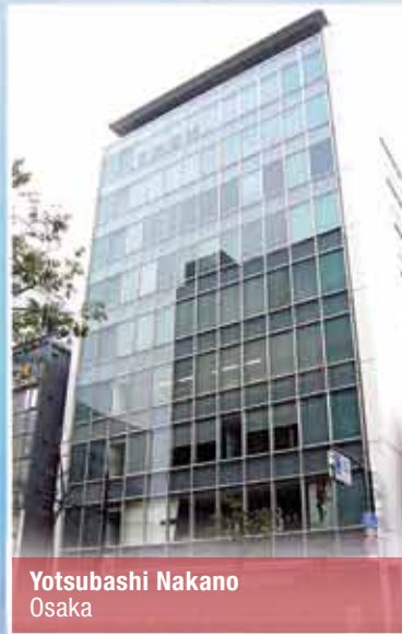
Yotsubashi Nakano Osaka