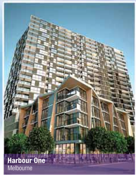
Harbour One Melbourne