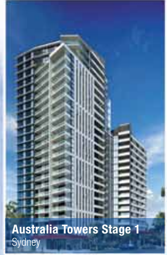
Australia Towers Stage 1 Sydney