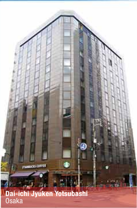
Dai-ichi Jyuken Yotsubashi Osaka