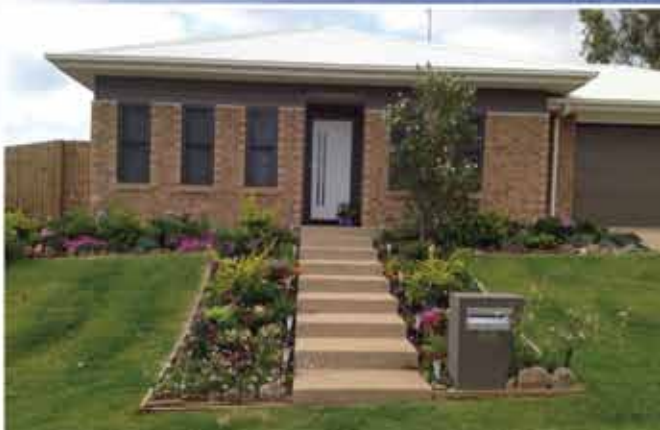
GLNG Housing Project Gladstone