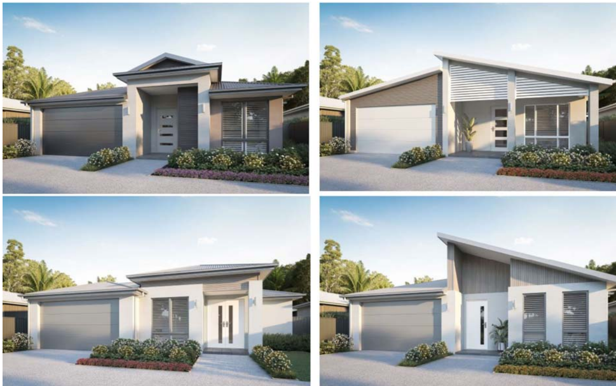
Examples of GemLife Pacific Paradise housing