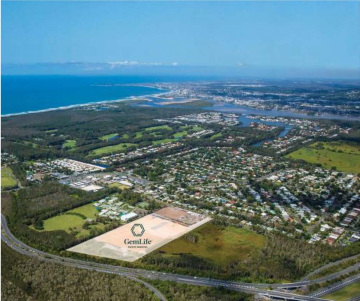
Aerial view of the GemLife Pacific Paradise site